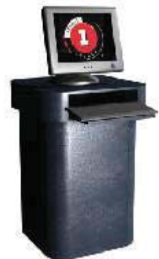
ACC25 Internet Station Size: 24" wide x 24" deep x 42" high Black only.