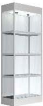
ACC18 Tower Display Case Size: 38" wide x 20" deep x 8' high Comes with lockable door.