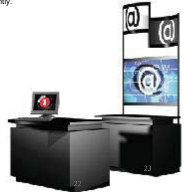
ACC22 Information Station Credenza Size: 58 1/4" wide x 34 3/4" x 42" high Comes with lockable door. Black only.