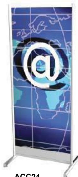
ACC24 Freestanding Panel with Digital Graphics Size: 40" wide x 8' high