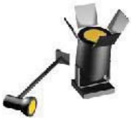
ACC11 Stem Light