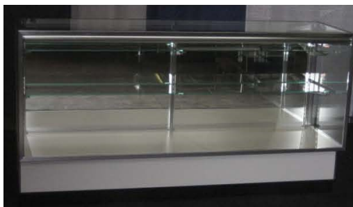
Full View Showcase