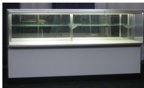
Half View Showcase