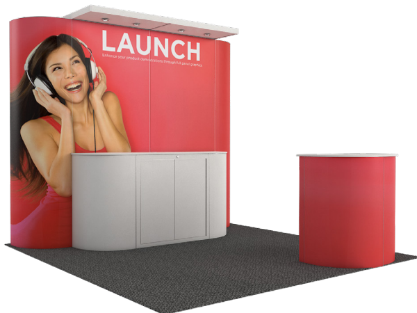
LAUNCH | 6900