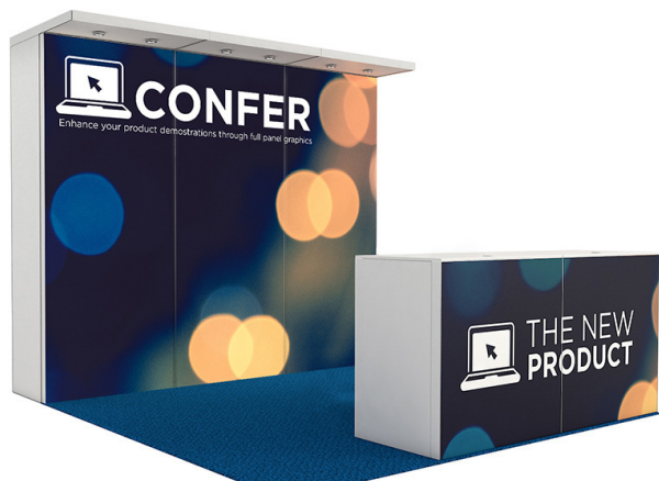
CONFER | 6645