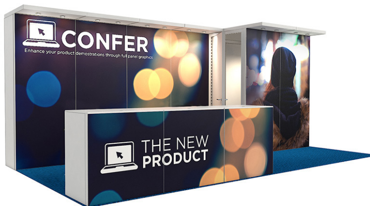
CONFER | 14830