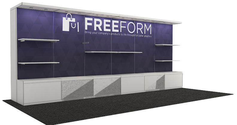
FREEFORM | 14400