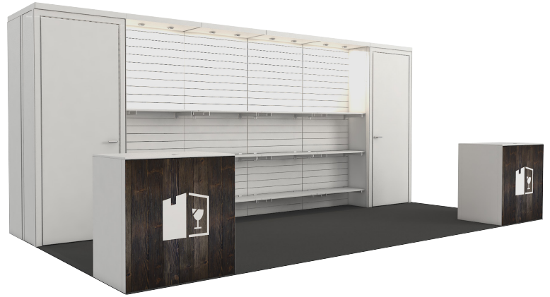
SHOWCASE W/ CLOSET & SLATWALL | 14500