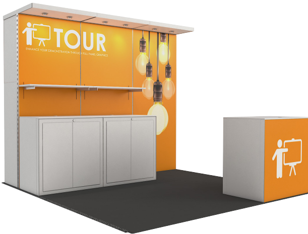
TOUR | 7600