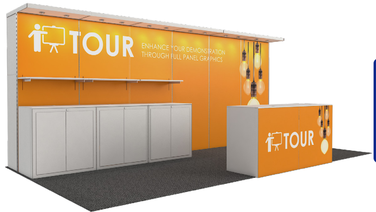
TOUR | 15495