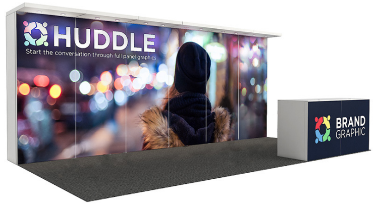
HUDDLE | 11825