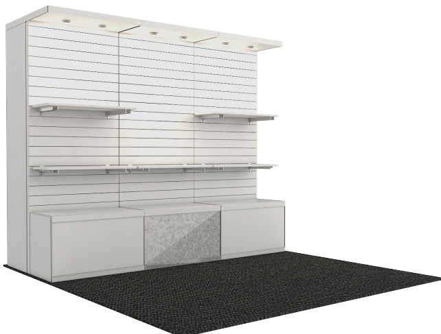
FREEFORM W/ SLATWALL | 7000