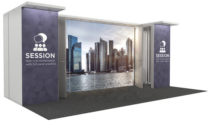
SESSION | 14445