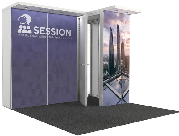
SESSION | 7110