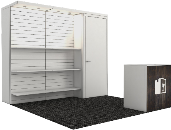
SHOWCASE W/ CLOSET & SLATWALL | 7250