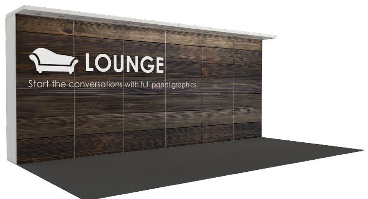
LOUNGE | 11000