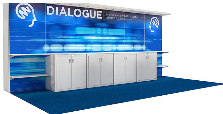
DIALOGUE | 14000