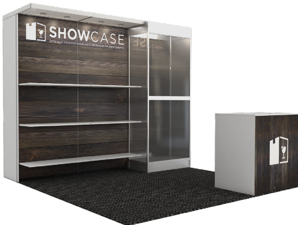
SHOWCASE | 7900