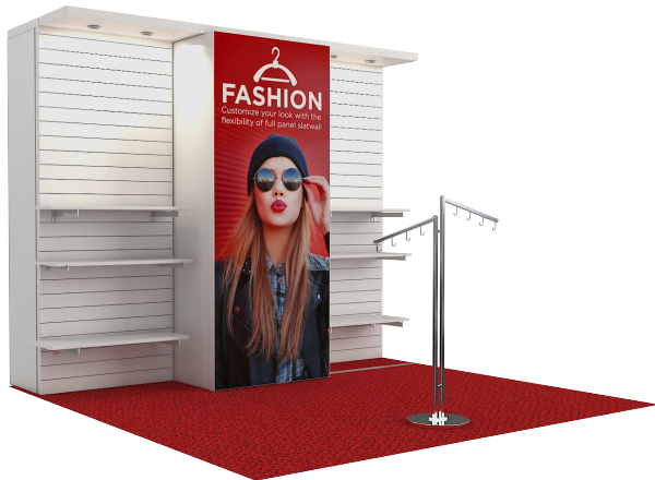
FASHION | 6900