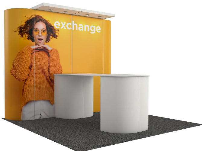
EXCHANGE | 7110