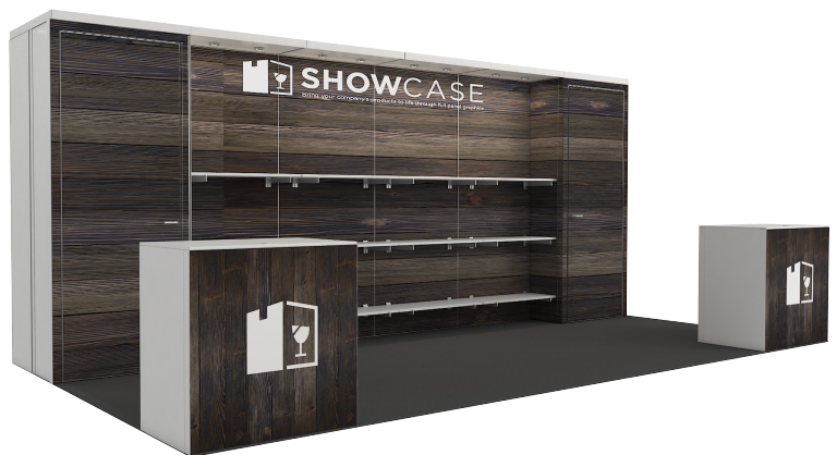
SHOWCASE W/ CLOSET | 15000