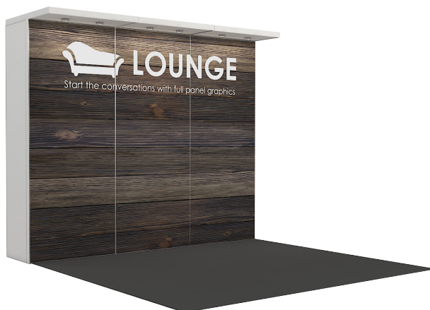
LOUNGE | 5500