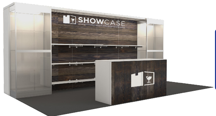
SHOWCASE | 15800