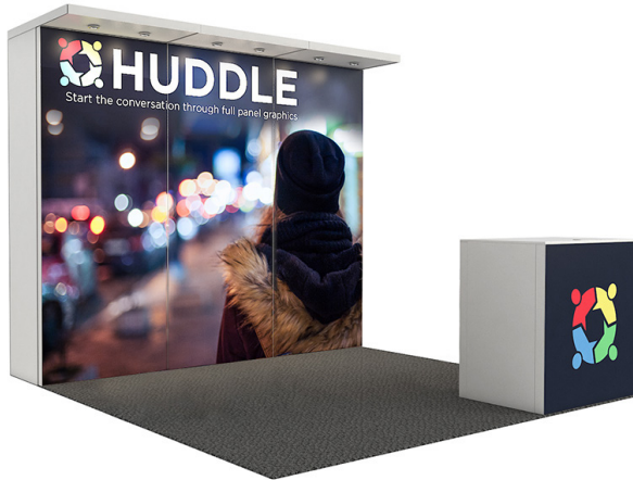
HUDDLE | 6010