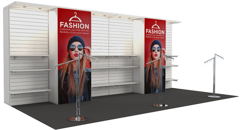
FASHION | 13600