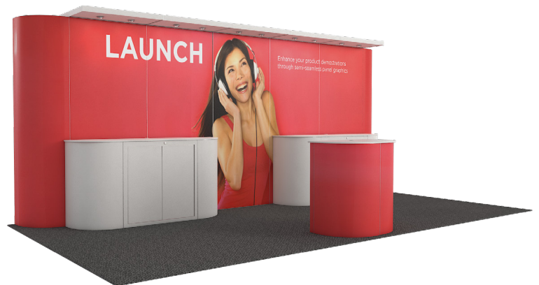
LAUNCH | 16300