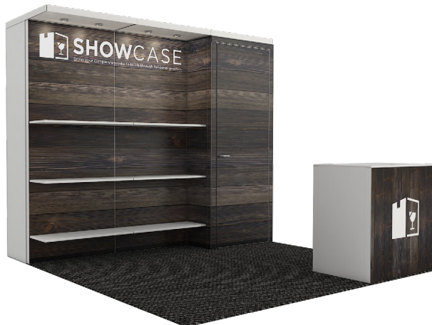
SHOWCASE W/ CLOSET | 7500