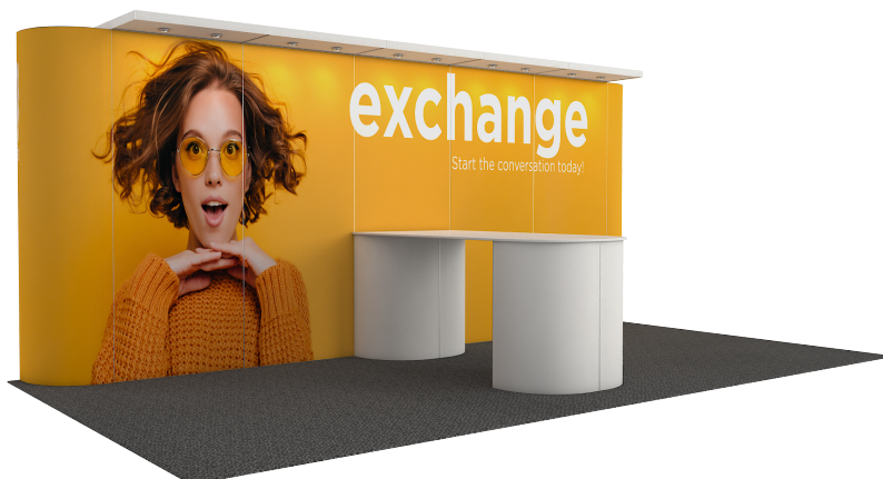
EXCHANGE | 13000