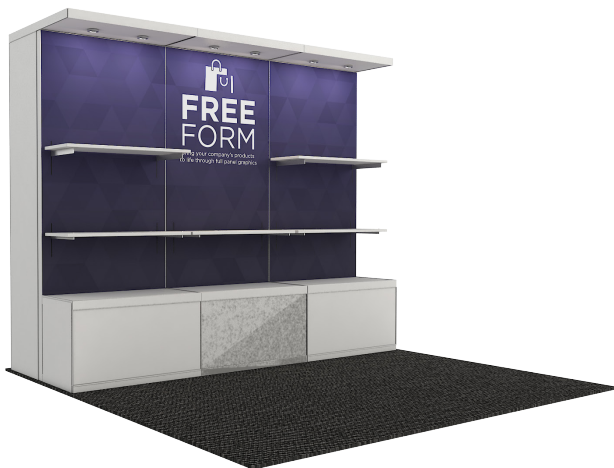
FREEFORM | 7200