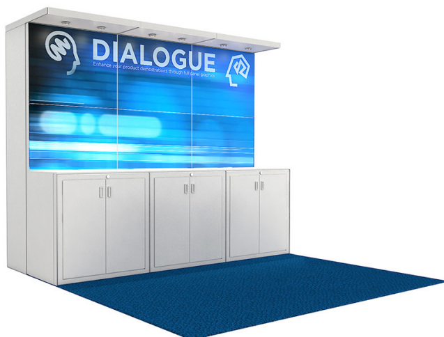
DIALOGUE | 7000